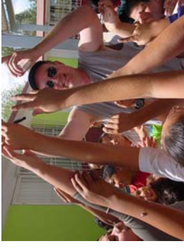
Handing out baseball cards in La Paz.

Included in the price are airfare, hotel, welcome and farewell meals, all group/SWC work-related ground transportation, and an SWC volunteer T-shirts. Not included are costs for extra activities. (A separate form for extra activities will be sent at a later date.) Some of this trip is tax-deductible, please consult your personal tax advisor. Accounting for all expenses will be provided to each volunteer at the end of the trip and all unused monies will be reimbursed.