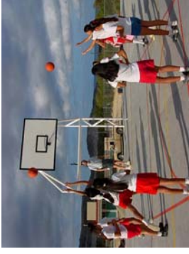
Basketball clinic in Los Barriles.

The dates for this 8-day trip are Saturday, April 19, to Sunday, April 27, 2008. Cost for the trip per person, double occupancy, is $1130 from Seattle, $1080 from the San Francisco/Bay Area, $930 from Los Angeles, and $1030 from Sacramento. Add $210 if rooming alone. (For other departure cities, or for trip price WITHOUT airfare, please contact SWC for more information.)