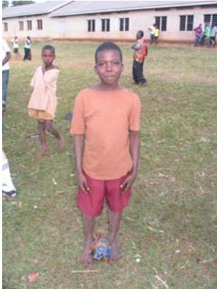
Sunday, March 16, 2008 (Jinja District)