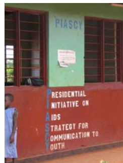
(Above) At the next school in Jinja District, we noticed the many HIV/AIDS-related messages painted on the walls, such as "Say NO to gifts for sex."