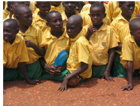
(Left) Here's another little guy with a banana fiber/polythene bag soccer ball.