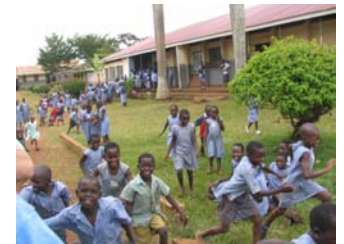
(Above) The children at the school did not want us to leave, and grabbed our hands through the windows of our bus. Then they ran after it as we were pulling away...