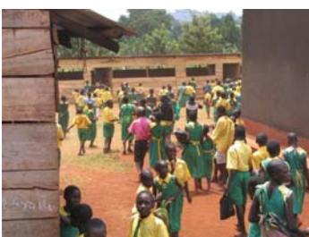
(Left) The students (approx. 1400) return to their classrooms.