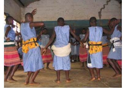
(Above) Monday, March 17, 2008

The next day, we returned to the school, to gather with the children, enjoy some song and traditional dance, and lively drumming.