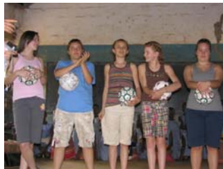
(Above) The Point Grey Greyhounds present soccer balls to the school.